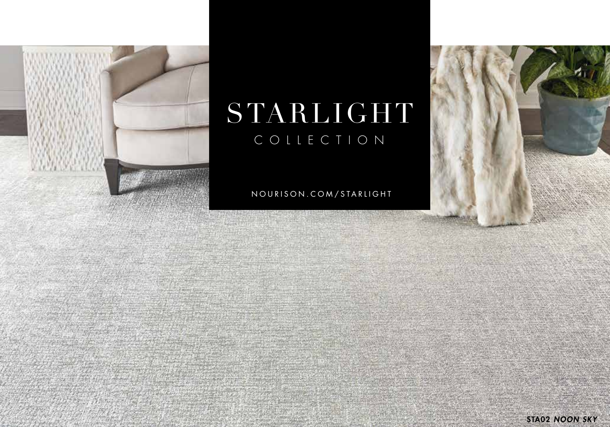
STA02 NOON SKY