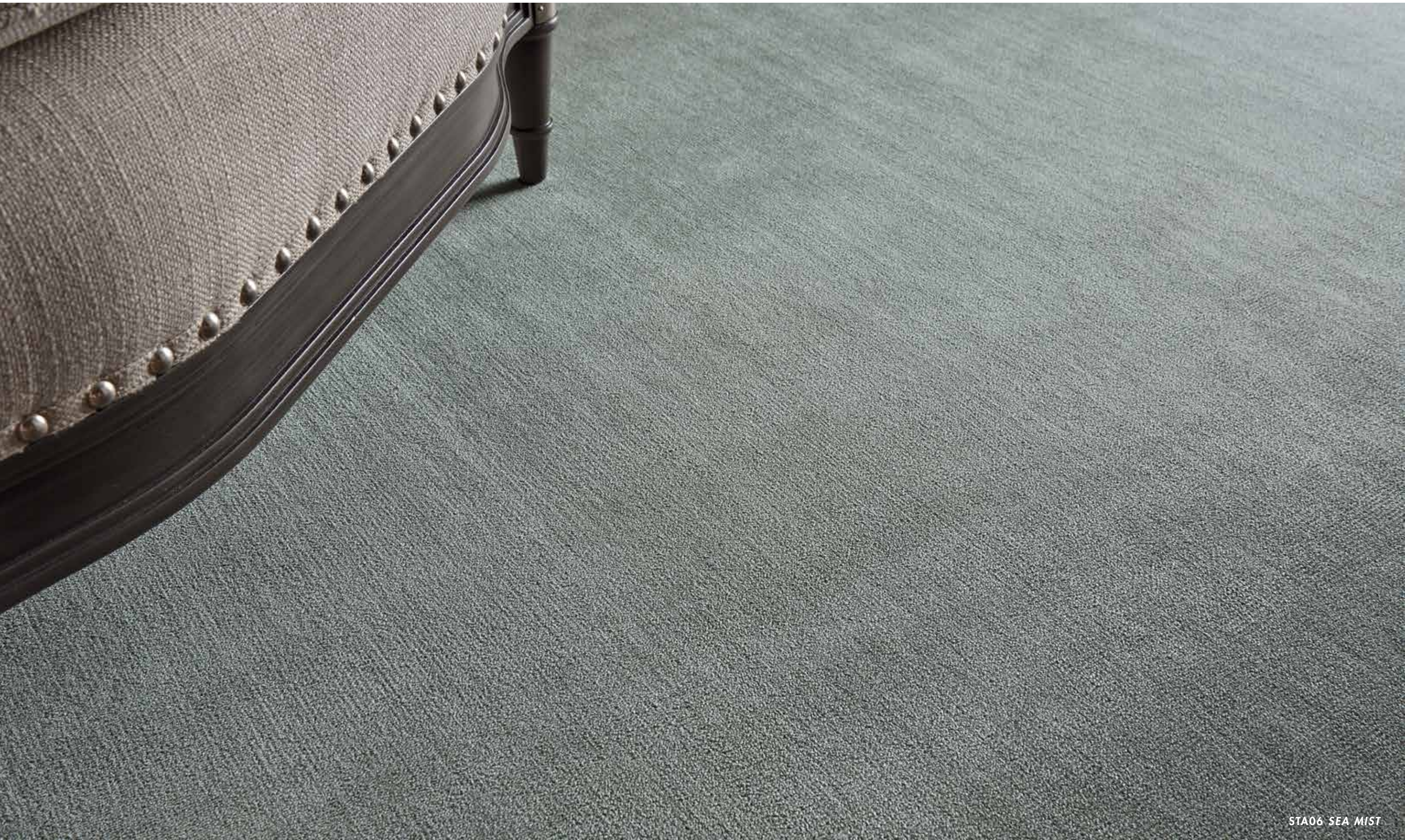
STA06 SEA MIST

THIS STYLE IS AVAILABLE IN MULTIPLE COLOR OPTIONS